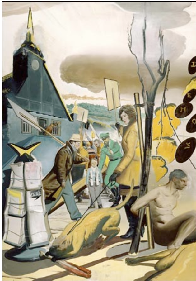
"Demos," 2004, Neo Rauch.